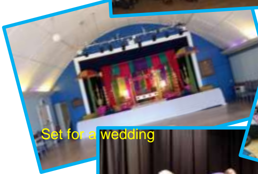
Set for a wedding