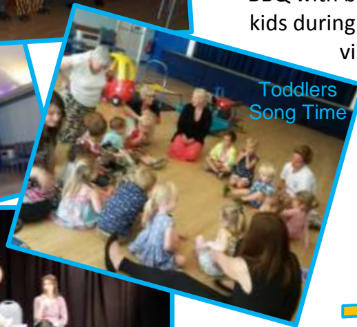
Toddlers Song Time